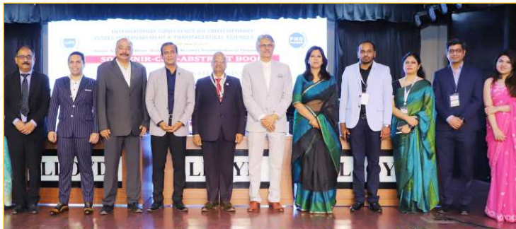
International Conference On "Contemporary Issues in Manag. & Pharm. Sciences" (2023)