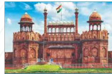
The Red Fort