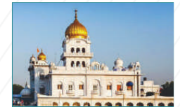
Gurudwara Bangla Sahib