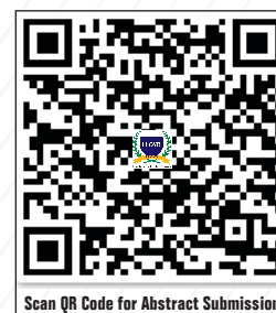
Scan QR Code for Abstract Submission