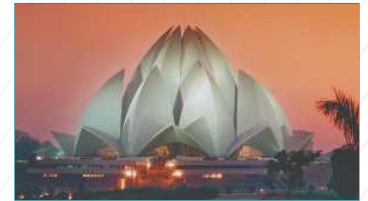
The Lotus Temple