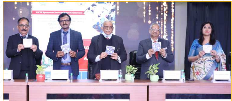
AICTE Sponsered International Conference on NEP-TRHE (2021)