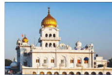
Gurudwara Bangla Sahib