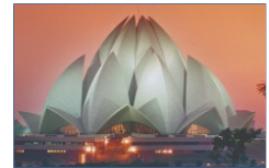
The Lotus Temple