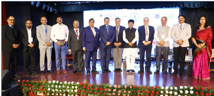
International Conference on "Transformation Through Technology and Transdisciplinary Education" (2023)