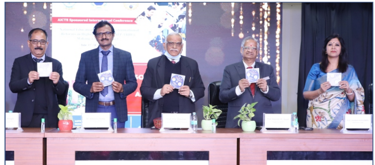
AICTE Sponsered International Conference on NEP-TRHE (2021)