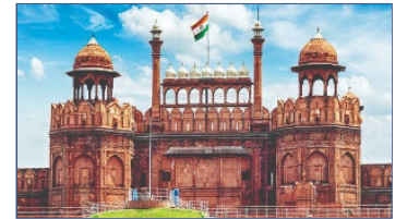
The Red Fort