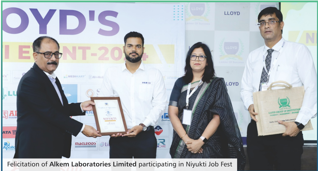
Felicitation of Alkem Laboratories Limited participating in Niyukti Job Fest