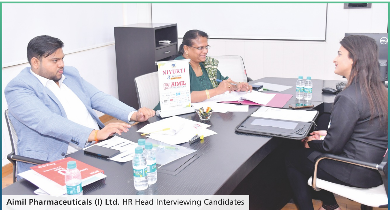
Aimil Pharmaceuticals (I) Ltd. HR Head Interviewing Candidates