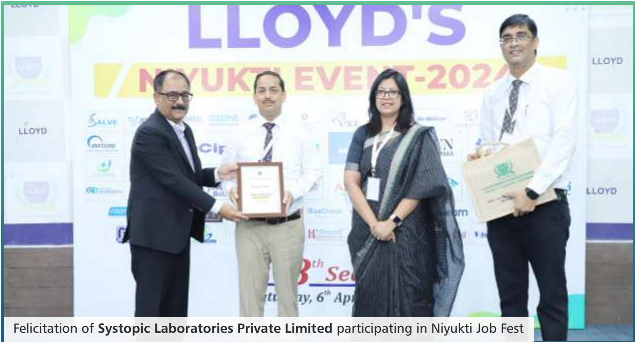
Felicitation of Systopic Laboratories Private Limited participating in Niyukti Job Fest