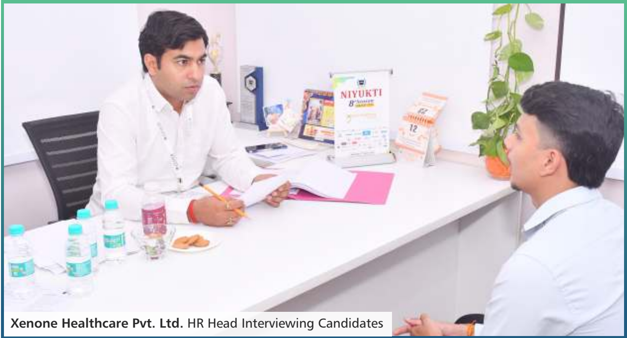
Xenone Healthcare Pvt. Ltd. HR Head Interviewing Candidates