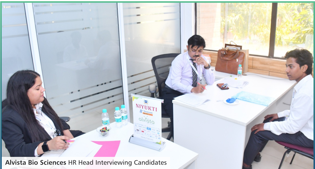
Alvista Bio Sciences HR Head Interviewing Candidates