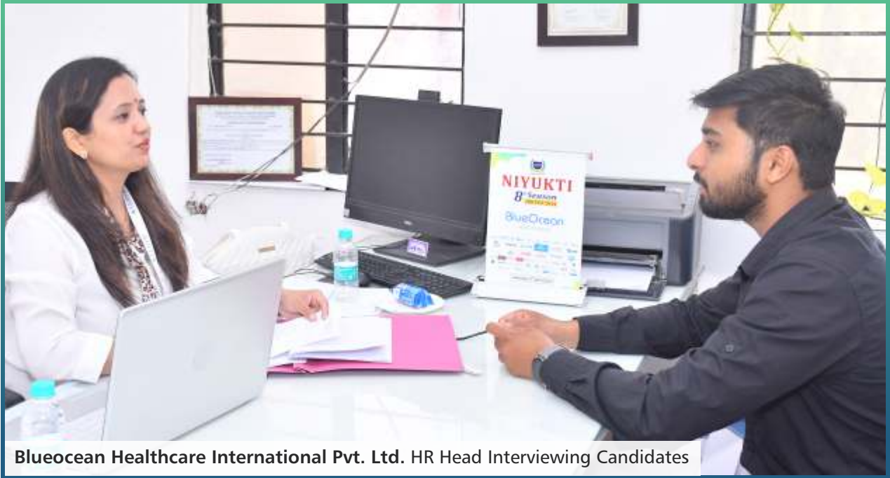
Blueocean Healthcare International Pvt. Ltd. HR Head Interviewing Candidates