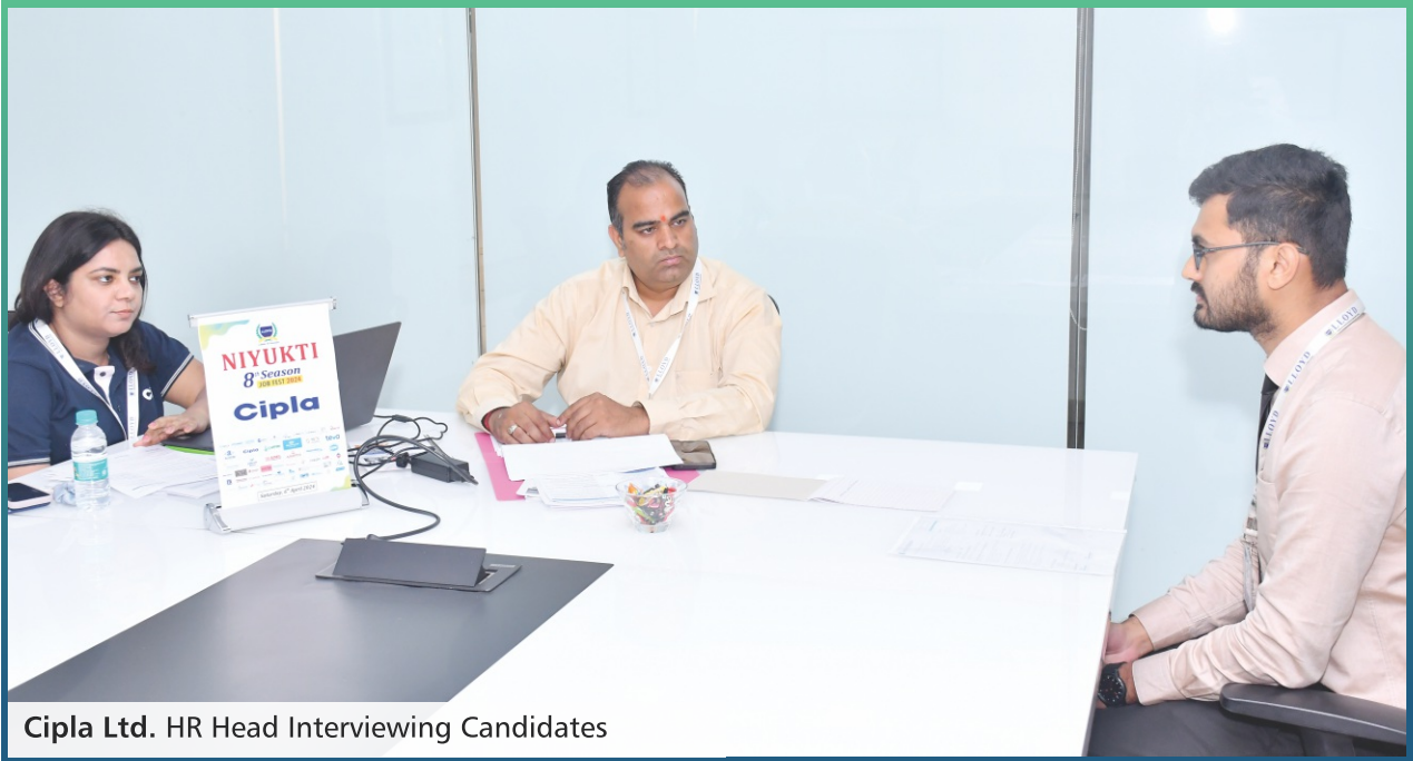
Cipla Ltd. HR Head Interviewing Candidates