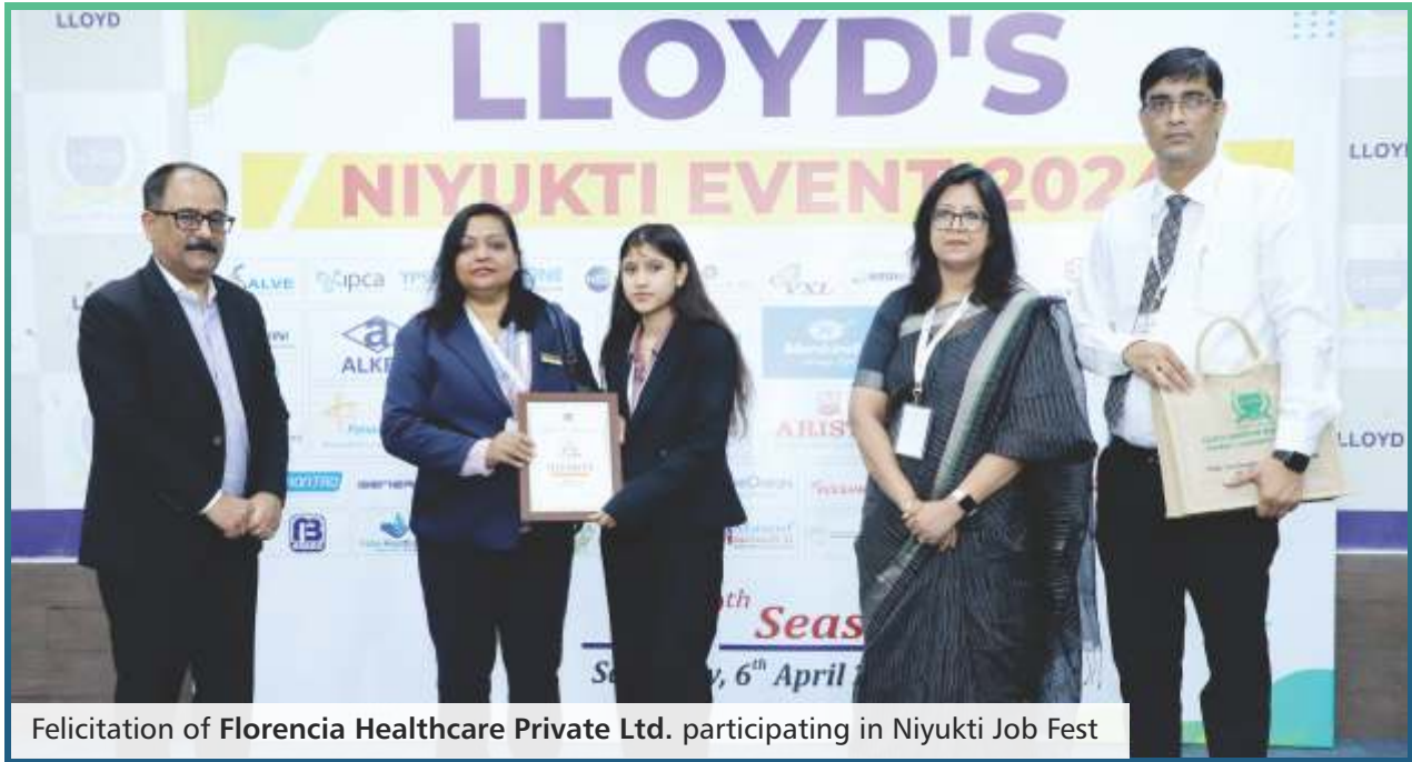
Felicitation of Florencia Healthcare Private Ltd. participating in Niyukti Job Fest