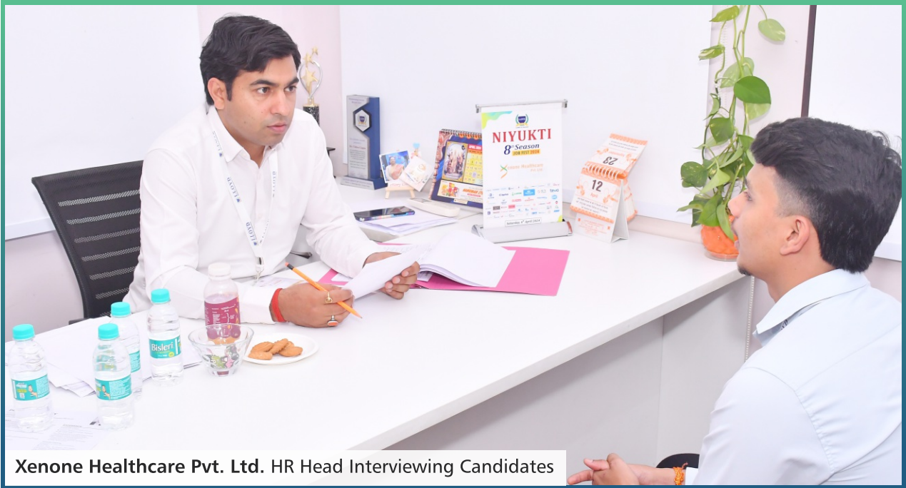
Xenone Healthcare Pvt. Ltd. HR Head Interviewing Candidates