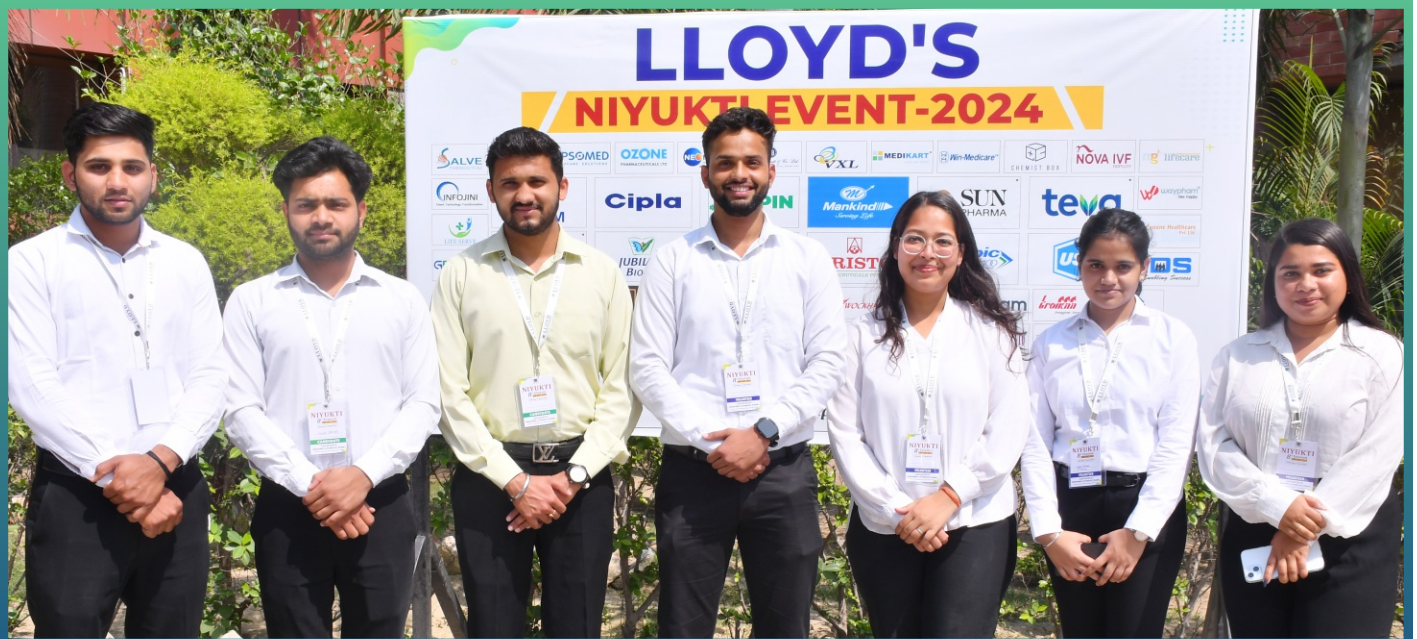
Students Participating in the Niyukti Job Fest.