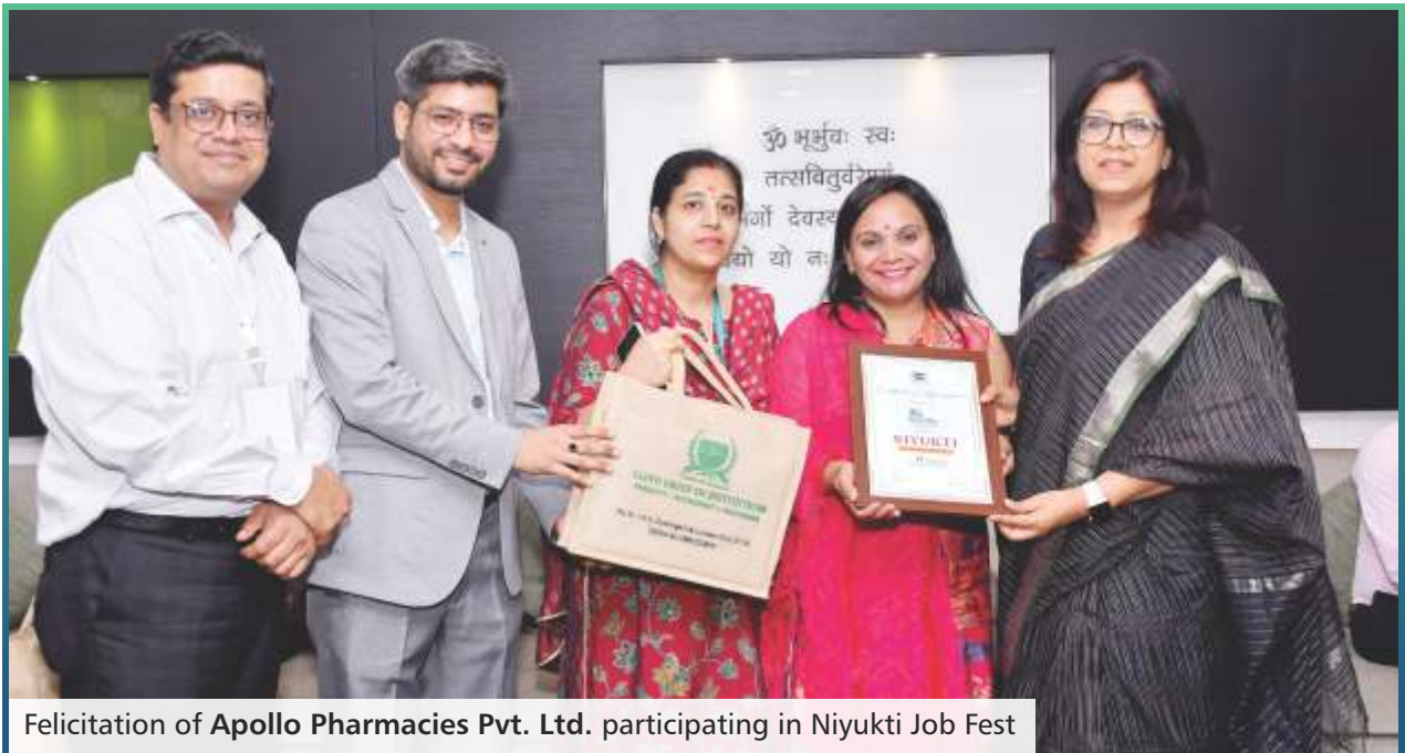
Felicitation of Apollo Pharmacies Pvt. Ltd. participating in Niyukti Job Fest