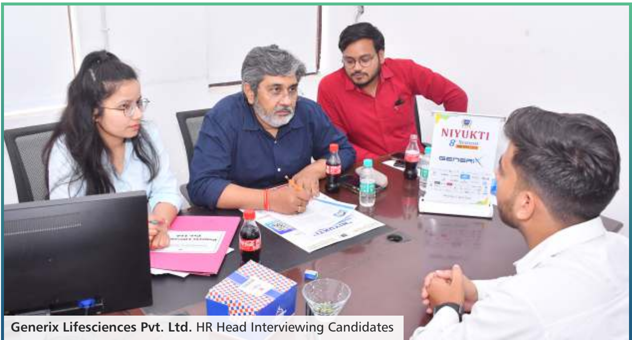
Generix Lifesciences Pvt. Ltd. HR Head Interviewing Candidates