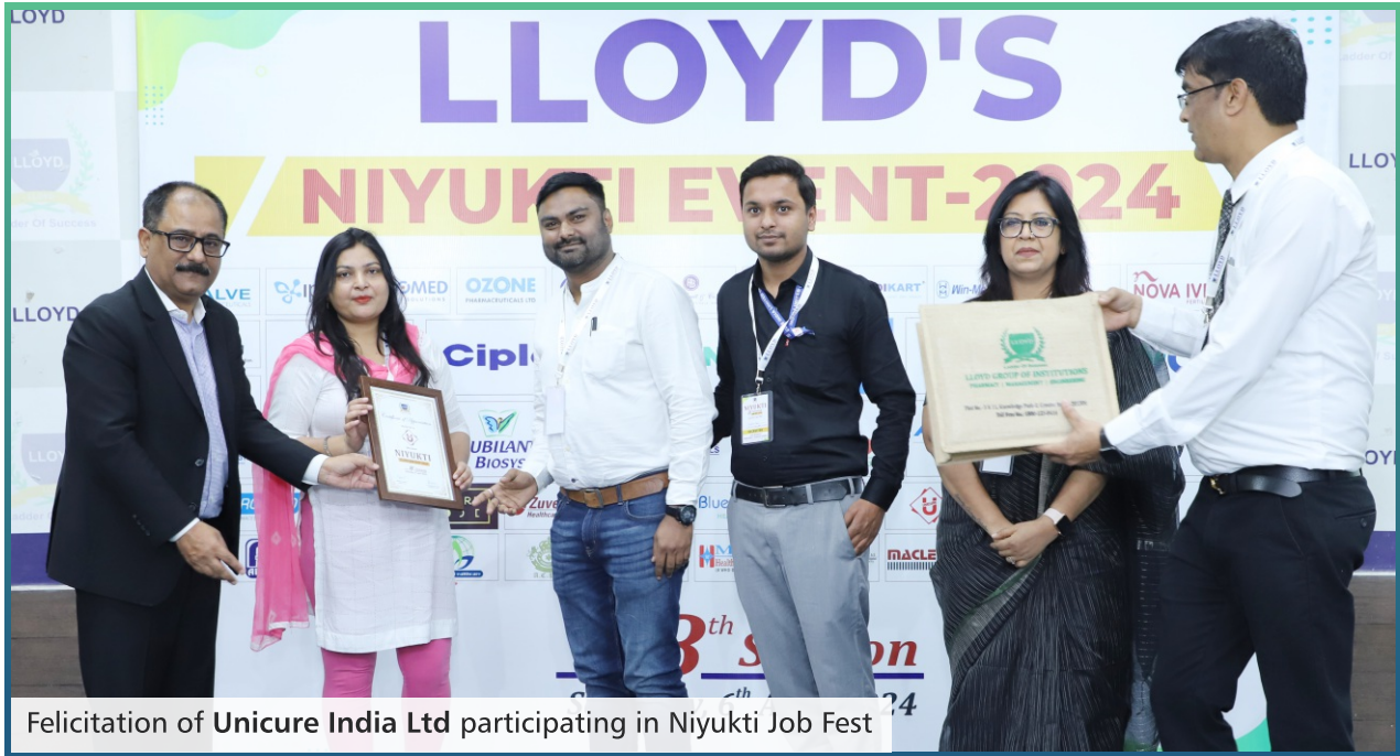
Felicitation of Unicare India Ltd participating in Niyukti Job Fest