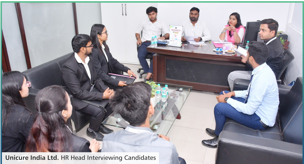
Unicare India Ltd. HR Head Interviewing Candidates