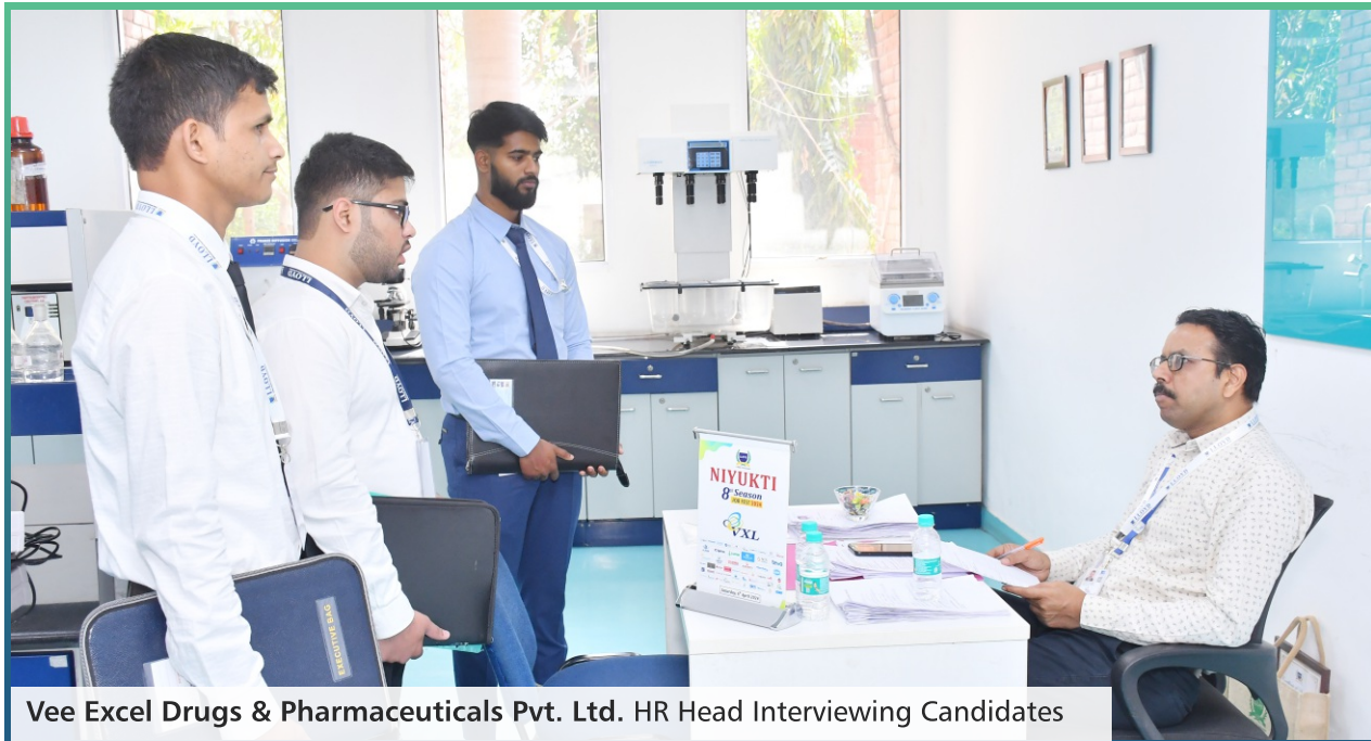
Vee Excel Drugs & Pharmaceuticals Pvt. Ltd. HR Head Interviewing Candidates