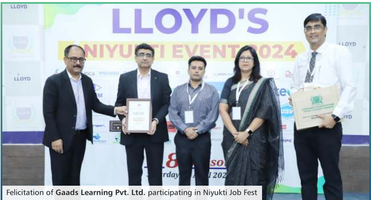
Felicitation of Gaads Learning Pvt. Ltd. participating in Niyukti Job Fest