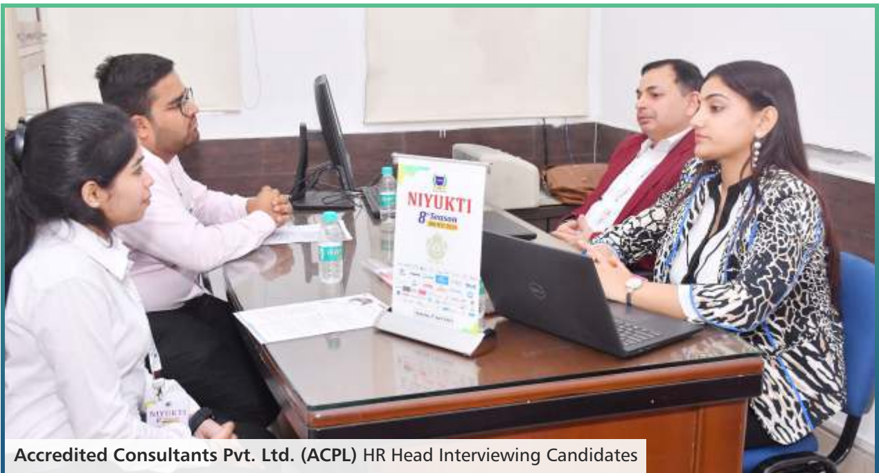
Accredited Consultants Pvt. Ltd. (ACPL) HR Head Interviewing Candidates