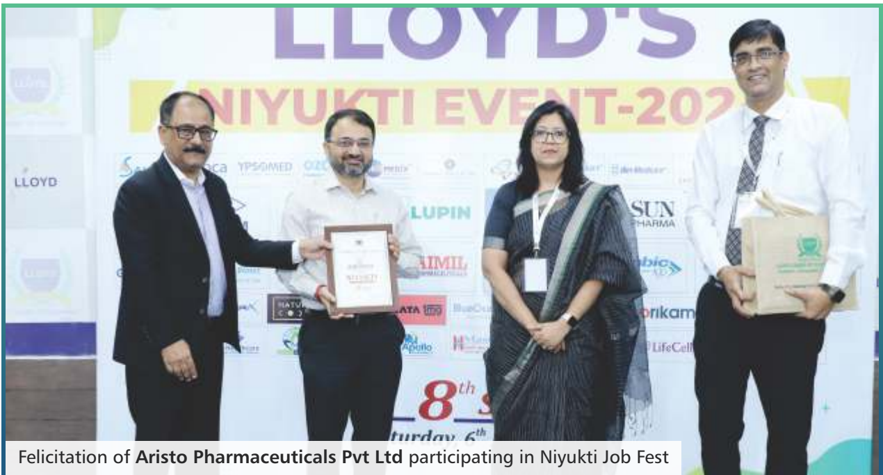
Felicitation of Aristo Pharmaceuticals Pvt Ltd participating in Niyukti Job Fest