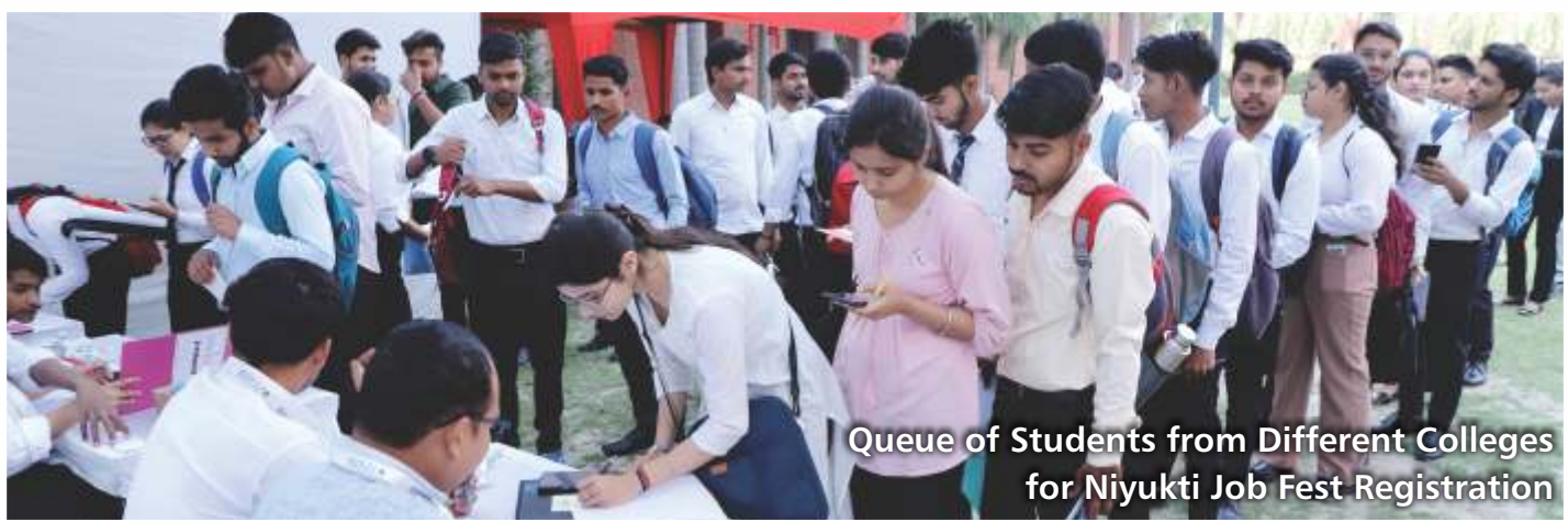
Queue of Students from Different Colleges for Niyukti Job Fest Registration