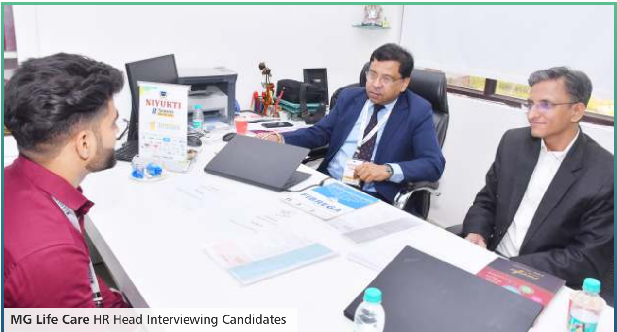
MG Life Care HR Head Interviewing Candidates