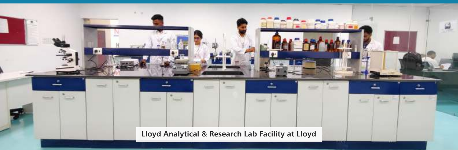
Lloyd Analytical & Research Lab Facility at Lloyd

innovation, and education. Creating a dedicated space for analytical testing and research will likely provide valuable opportunities for students, researchers, and professionals alike to contribute to the field and enhance their skills. This initiative could also potentially foster partnerships between academia and industry, leading to mutual benefits and advancements in the field of analytical testing and research.