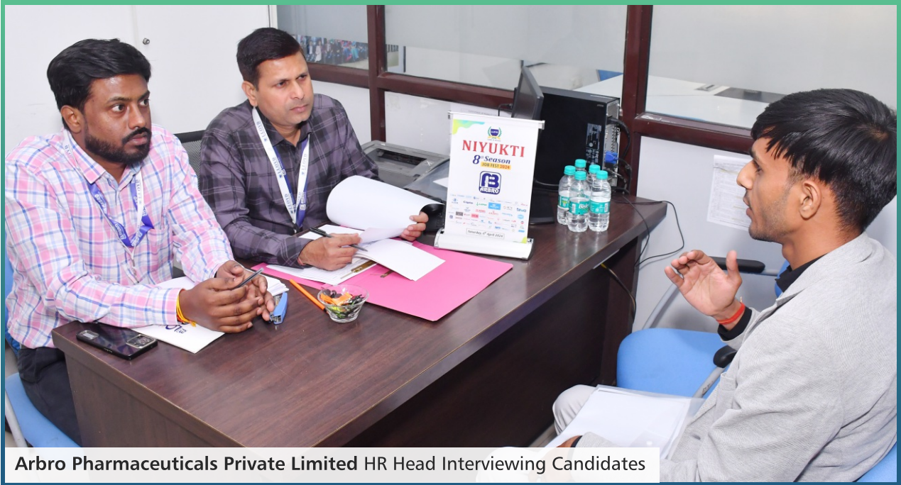
Arbro Pharmaceuticals Private Limited HR Head Interviewing Candidates