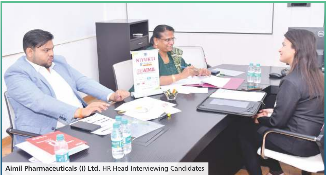
Aimil Pharmaceuticals (I) Ltd. HR Head Interviewing Candidates