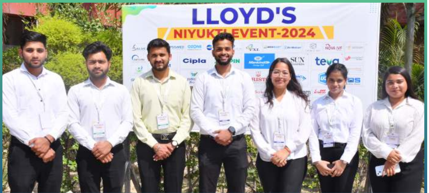
Students Participating in the Niyukti Job Fest.