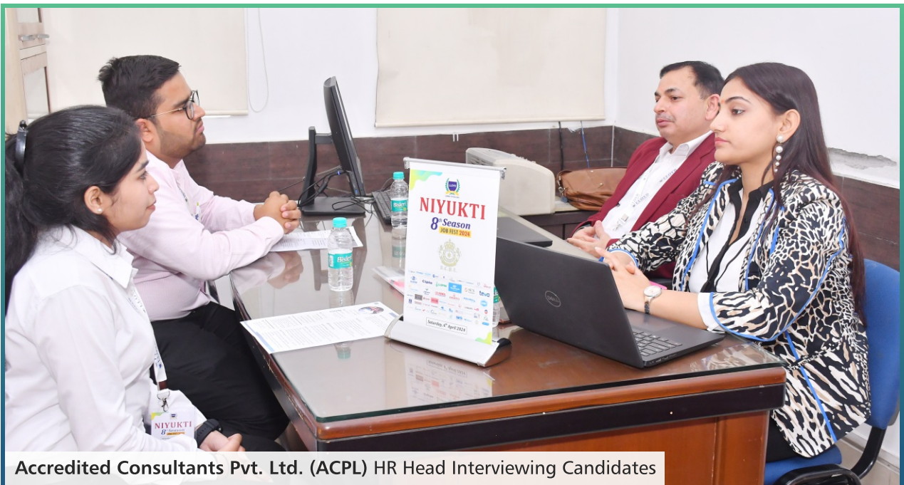
Accredited Consultants Pvt. Ltd. (ACPL) HR Head Interviewing Candidates