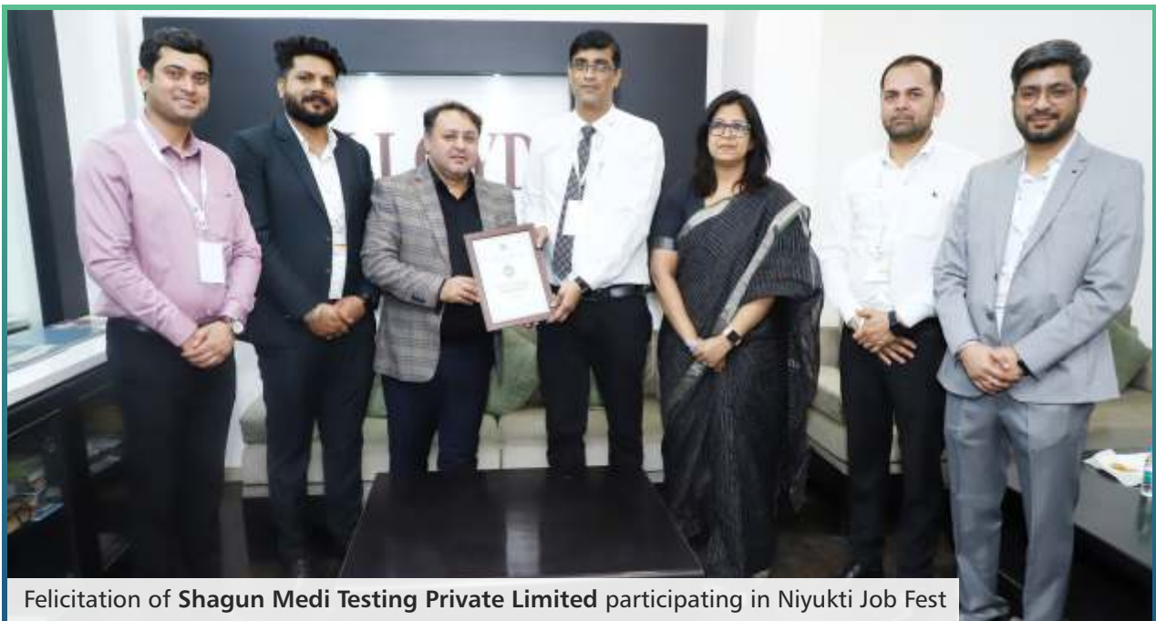
Felicitation of Shagun Medi Testing Private Limited participating in Niyukti Job Fest