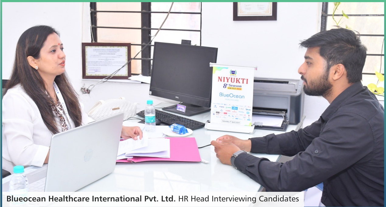
Blueocean Healthcare International Pvt. Ltd. HR Head Interviewing Candidates