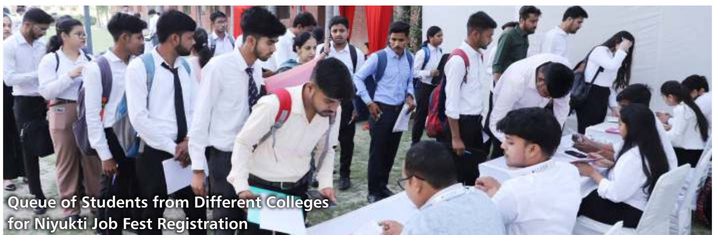
Queue of Students from Different Colleges for Niyukti Job Fest Registration

Many celebrated brand names such as Cipla Ltd, Mankind, Alembic Pharmaceuticals, Lupin Ltd, Alkem Laboratories, AIMIL Pharmaceuticals, Aristo Pharma, Felix Hospitals, Apollo Pharmacy, Ypsomed India, Raptakos Brett & Co. Ltd., Arbro Pharmaceuticals, Unicure India Ltd, Alvista Bio Sciences , Blueocean Healthcare, Mascot Health Series, Systopic Laboratories, Vee Excel Drugs & Pharmaceuticals, Florencia Healthcare, Generix Lifesciences, Shagun Medi Testing Private Limited, Waypham India Pvt. Ltd., MG Life Care, General Diagnostics International, Kayra Innopharm, Xenone Healthcare, Chemist Box Pvt. Ltd., Medikart Healthcare, Infojini Inc., and many more participated in the Job-Fest in search of their desired candidates. They shortlisted candidates for different profiles such as Production, Quality Assurance (QA), Quality Control (QC), Formulation & Development (F&D), Drug Regulatory Affairs (DRA), Sales & Marketing, Retail & Hospital Pharmacist, Market Research, etc.