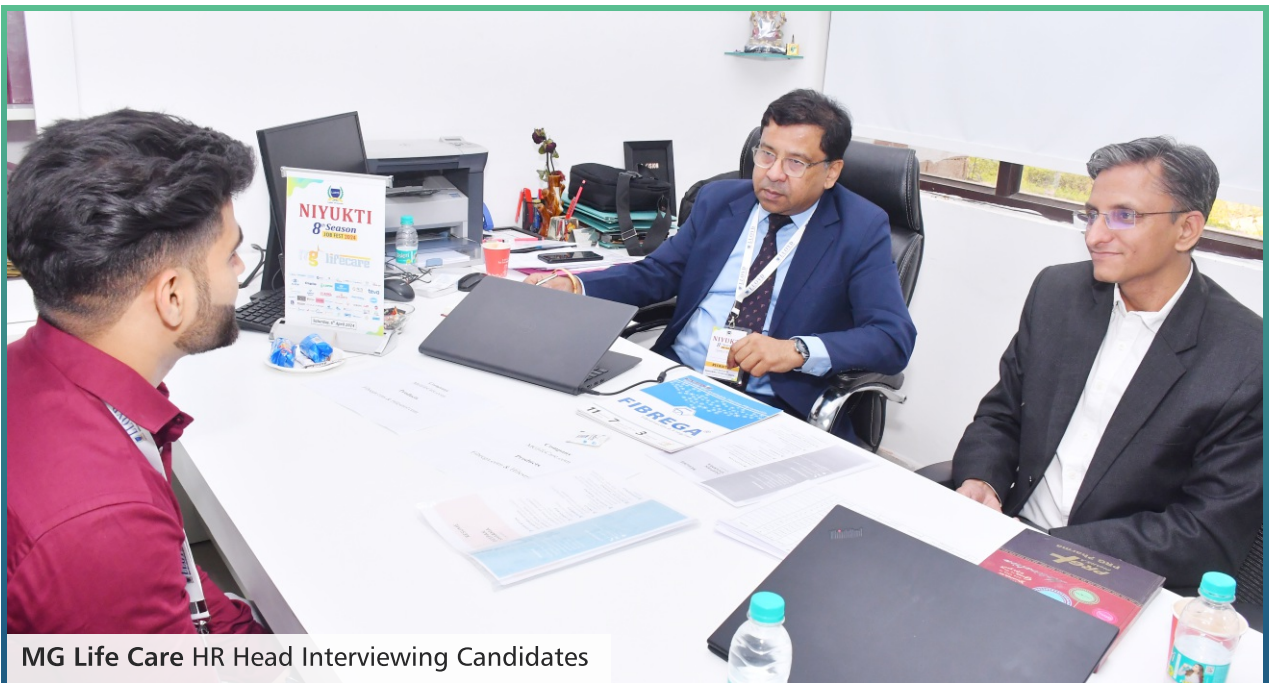
MG Life Care HR Head Interviewing Candidates