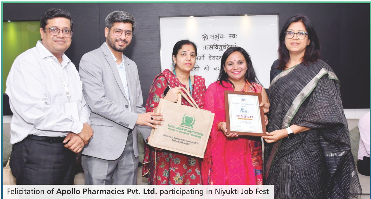
Felicitation of Apollo Pharmacies Pvt. Ltd. participating in Niyukti Job Fest