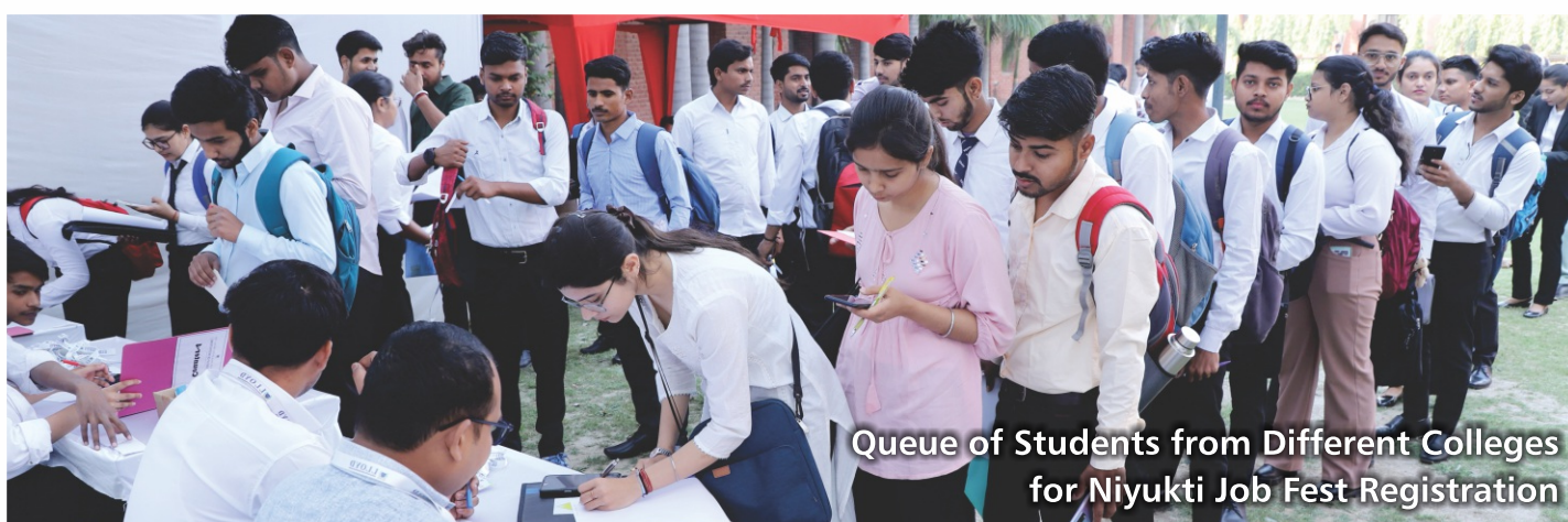
Queue of Students from Different Colleges for Niyukti Job Fest Registration