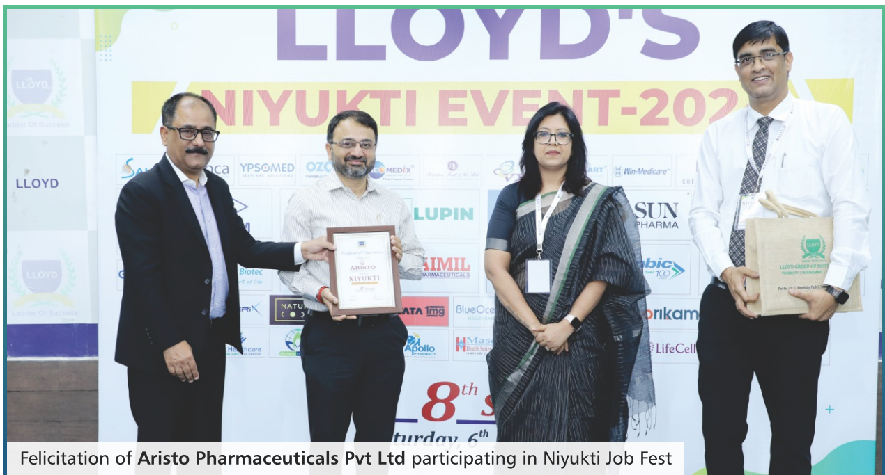
Felicitation of Aristo Pharmaceuticals Pvt Ltd participating in Niyukti Job Fest