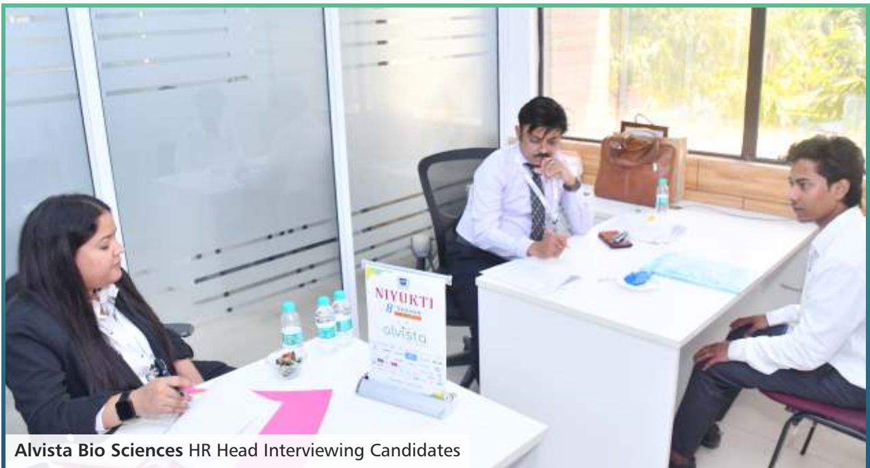
Alvista Bio Sciences HR Head Interviewing Candidates