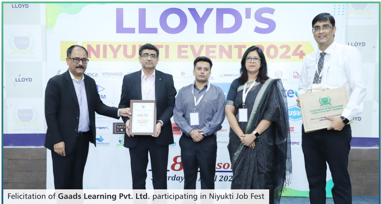
Felicitation of Gaads Learning Pvt. Ltd. participating in Niyukti Job Fest