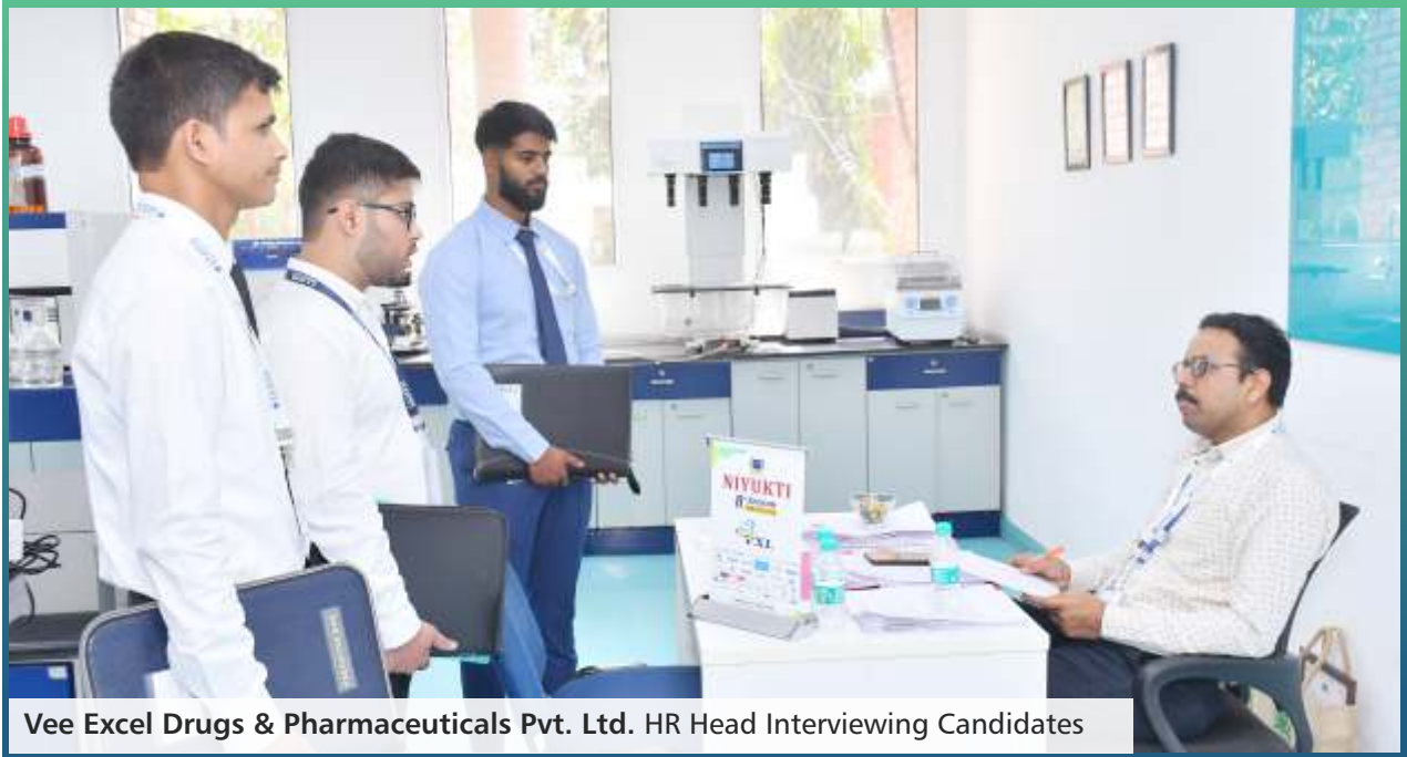
Vee Excel Drugs & Pharmaceuticals Pvt. Ltd. HR Head Interviewing Candidates