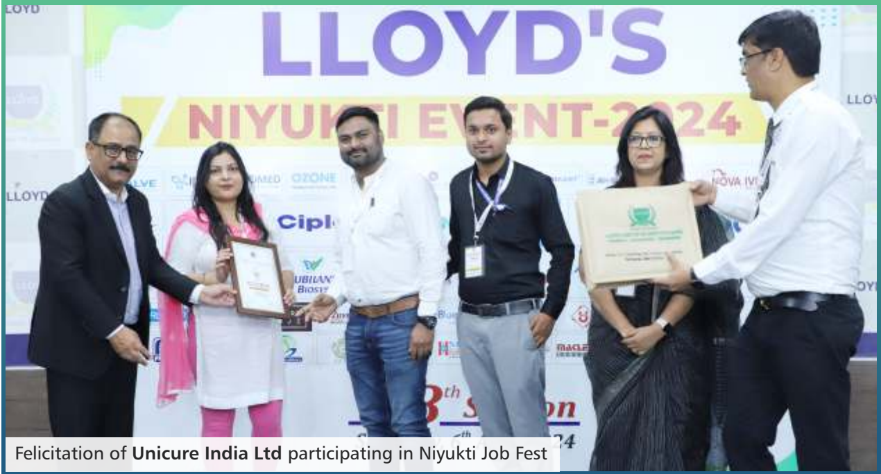
Felicitation of Unicare India Ltd participating in Niyukti Job Fest