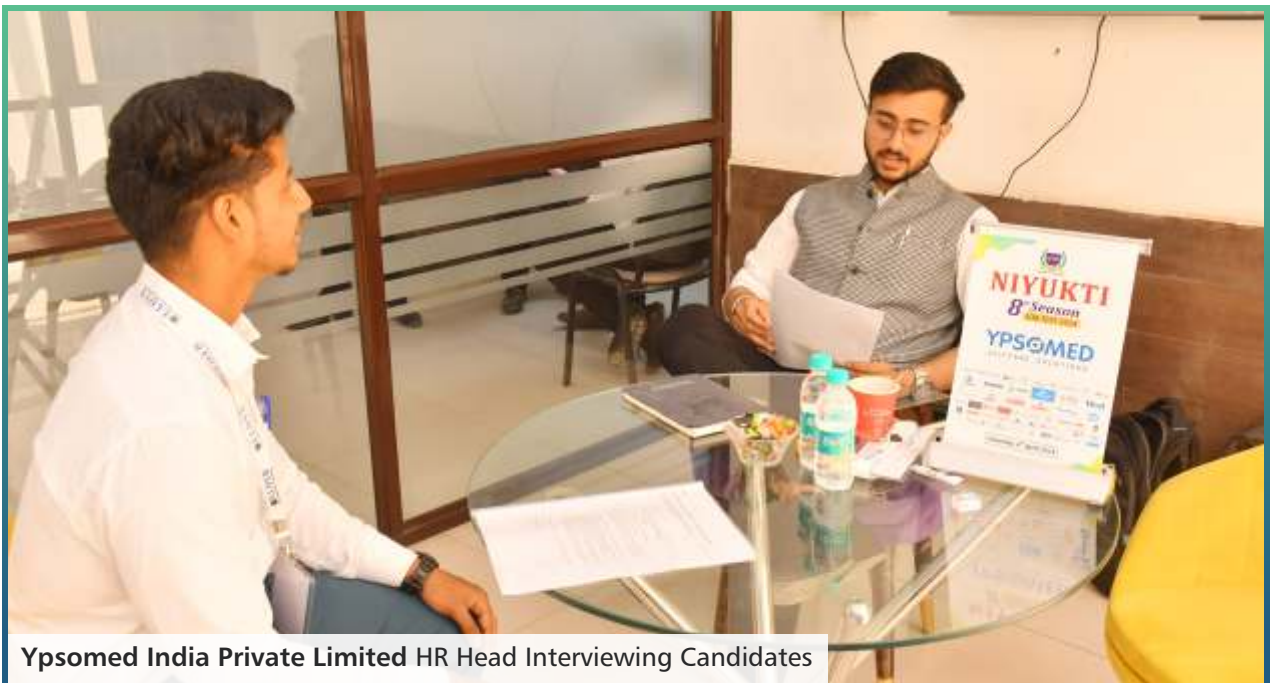
Ypsomed India Private Limited HR Head Interviewing Candidates