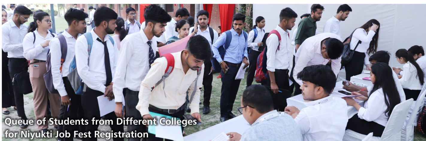
Queue of Students from Different Colleges for Niyukti Job Fest Registration

Many celebrated brand names such as Cipla Ltd, Mankind, Alembic Pharmaceuticals, Lupin Ltd, Alkem Laboratories, AIMIL Pharmaceuticals, Aristo Pharma, Felix Hospitals, Apollo Pharmacy, Ypsomed India, Raptakos Brett & Co. Ltd., Arbro Pharmaceuticals, Unicure India Ltd, Alvista Bio Sciences, Blueocean Healthcare, Mascot Health Series, Systopic Laboratories, Vee Excel Drugs & Pharmaceuticals, Florencia Healthcare, Generix Lifesciences, Shagun Medi Testing Private Limited, Waypham India Pvt. Ltd., MG Life Care, General Diagnostics International, Kayra Innopharm, Xenone Healthcare, Chemist Box Pvt. Ltd., Medikart Healthcare, Infojini Inc., and many more participated in the Job-Fest in search of their desired candidates. They shortlisted candidates for different profiles such as Production, Quality Assurance (QA), Quality Control (QC), Formulation & Development (F&D), Drug Regulatory Affairs (DRA), Sales & Marketing, Retail & Hospital Pharmacist, Market Research, etc.