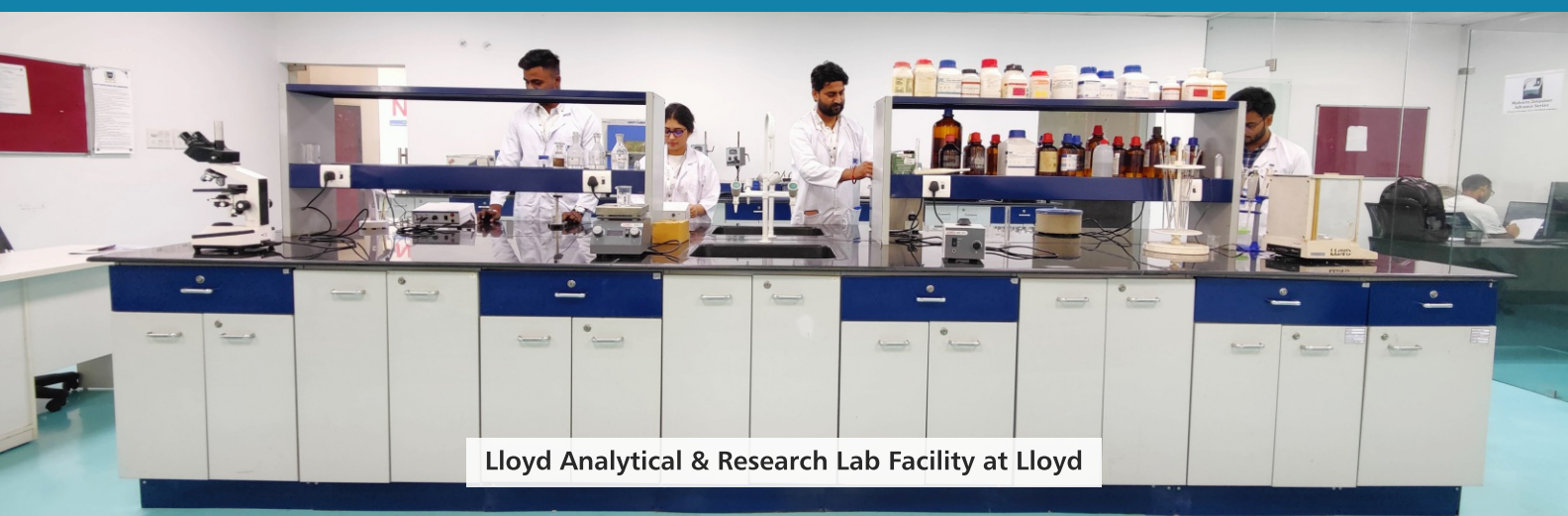
Lloyd Analytical & Research Lab Facility at Lloyd

innovation, and education. Creating a dedicated space for analytical testing and research will likely provide valuable opportunities for students, researchers, and professionals alike to contribute to the field and enhance their skills. This initiative could also potentially foster partnerships between academia and industry, leading to mutual benefits and advancements in the field of analytical testing and research.