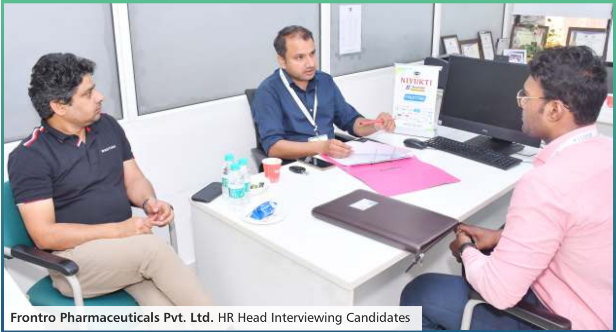
Frontro Pharmaceuticals Pvt. Ltd. HR Head Interviewing Candidates