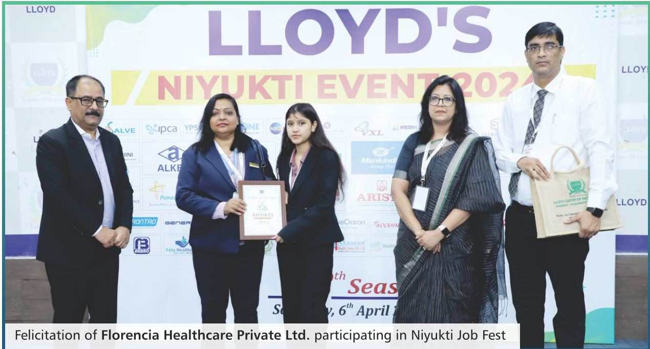
Felicitation of Florencia Healthcare Private Ltd. participating in Niyukti Job Fest