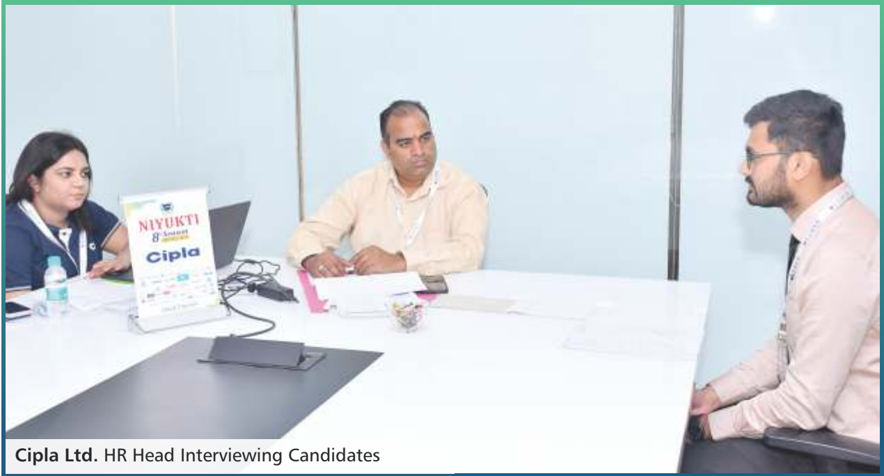
Cipla Ltd. HR Head Interviewing Candidates