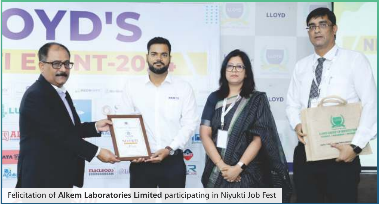
Felicitation of Alkem Laboratories Limited participating in Niyukti Job Fest