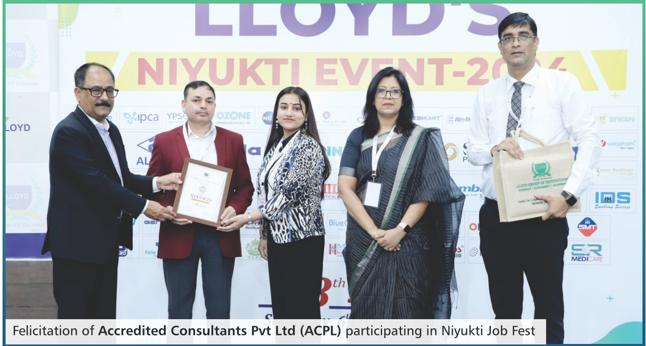
Felicitation of Accredited Consultants Pvt Ltd (ACPL) participating in Niyukti Job Fest