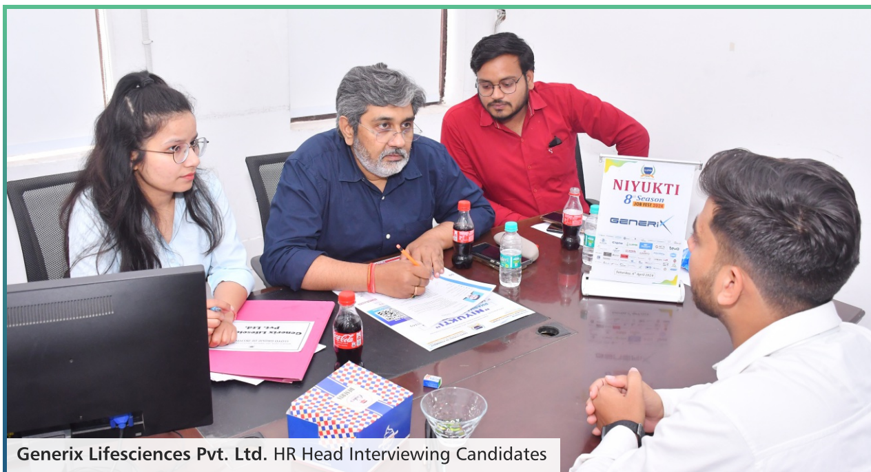
Generix Lifesciences Pvt. Ltd. HR Head Interviewing Candidates