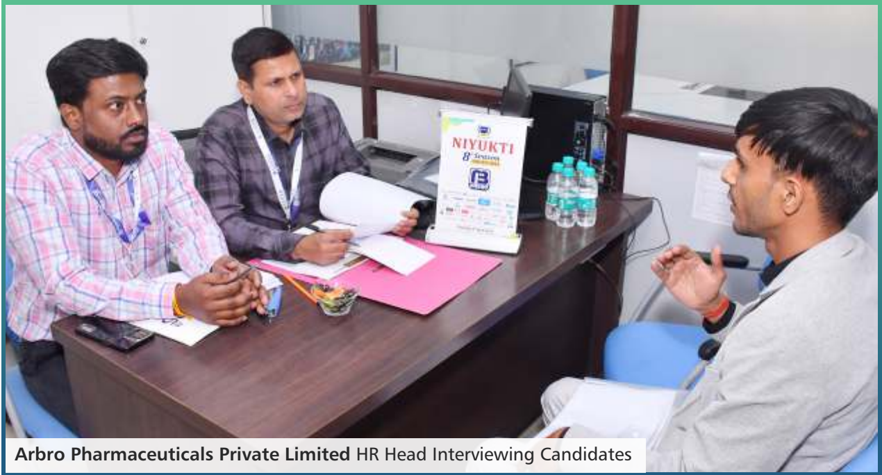
Arbro Pharmaceuticals Private Limited HR Head Interviewing Candidates