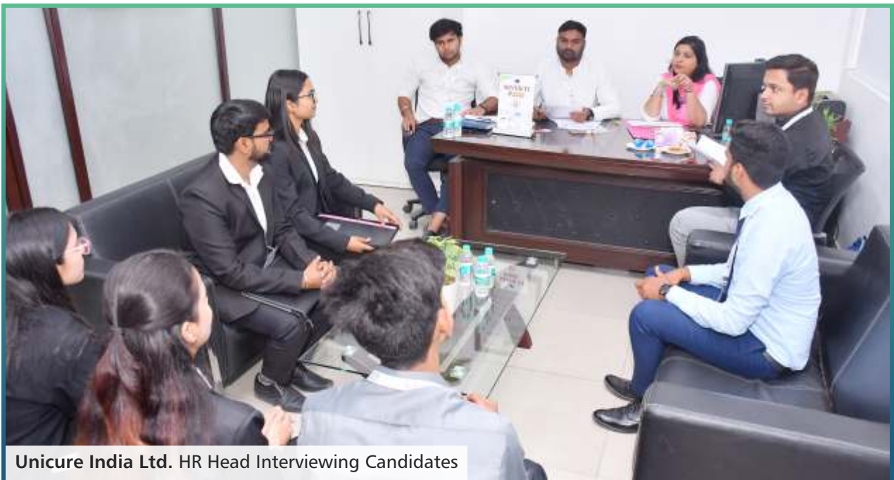
Unicare India Ltd. HR Head Interviewing Candidates