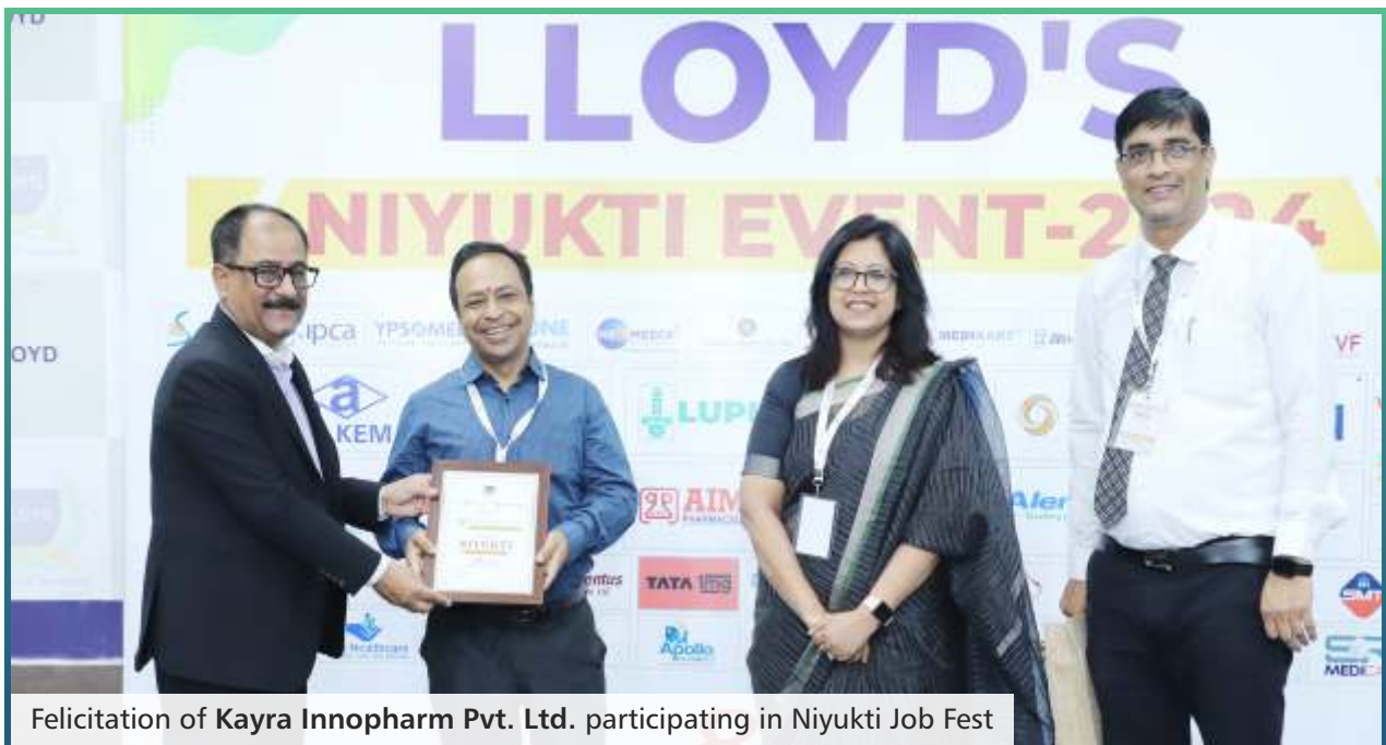
Felicitation of Kayra Innopharm Pvt. Ltd. participating in Niyukti Job Fest