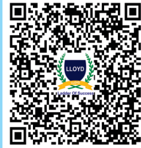
Scan QR Code for Registration