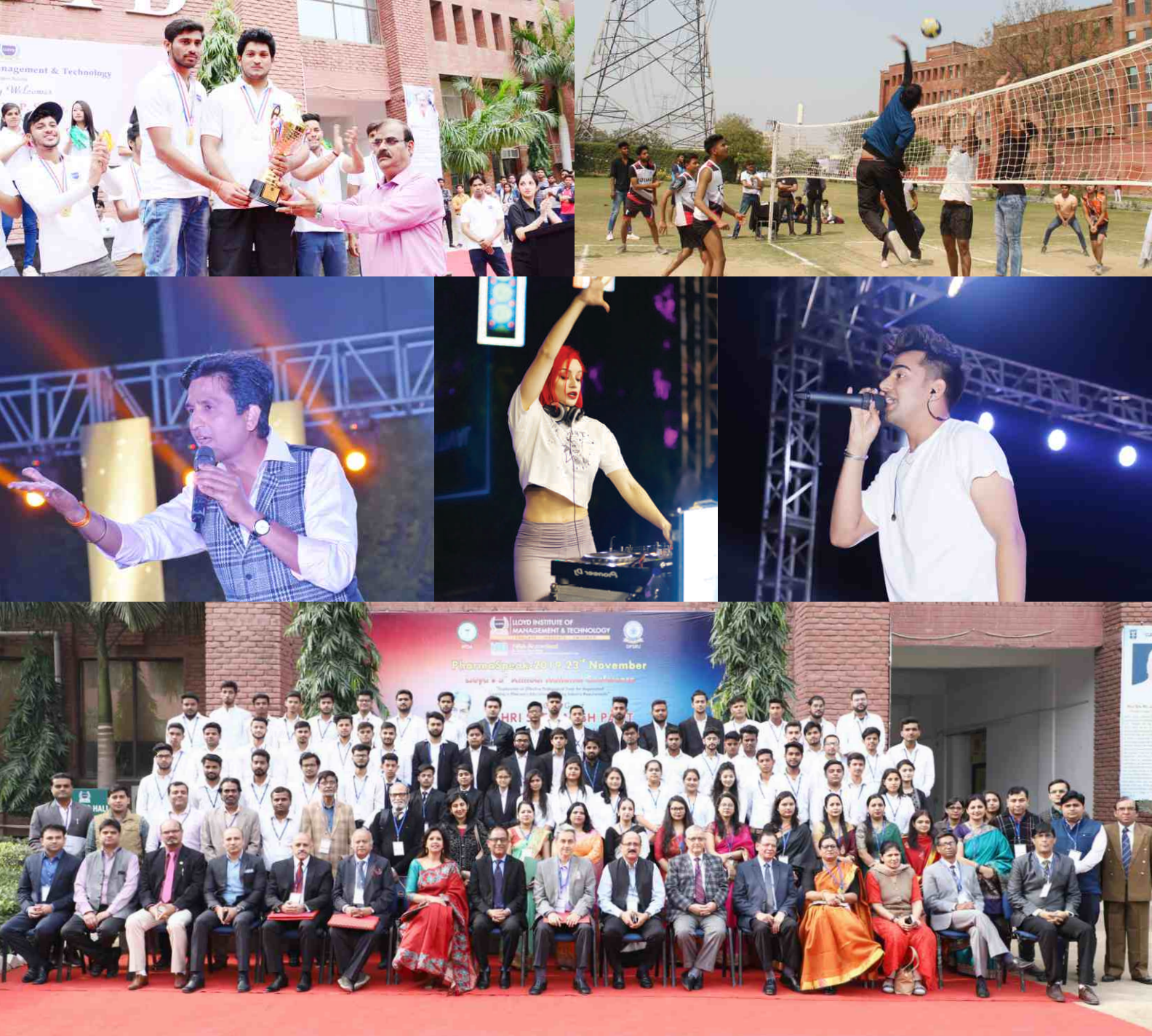
Lloyd's Pharmacy Faculty & Staff along with dignitaries and students